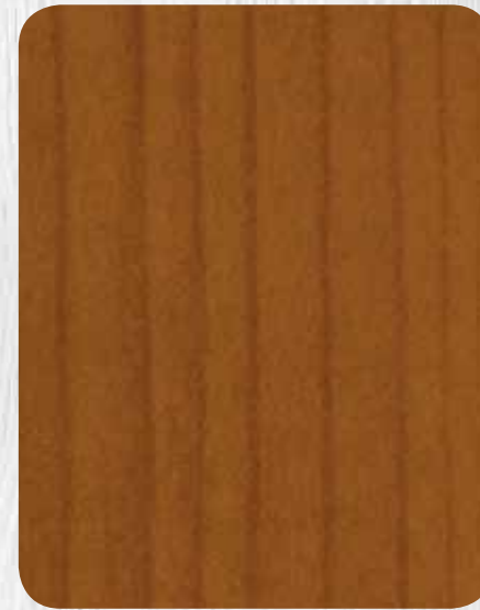
Colony Maple - DS716S + 1101/02