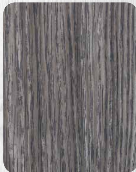
Aged Light Oak - DS704SU + 2507/18