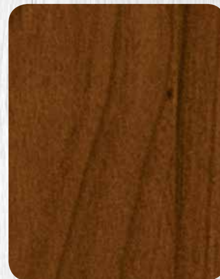
European Cherry - DS716S + 1406/01