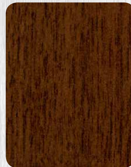
Golden Oak - DS733S + 2505/01