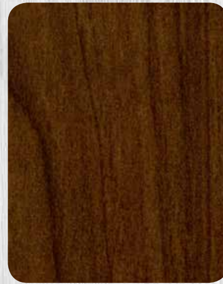
Cherry with Flame - DS733S + 1401/01