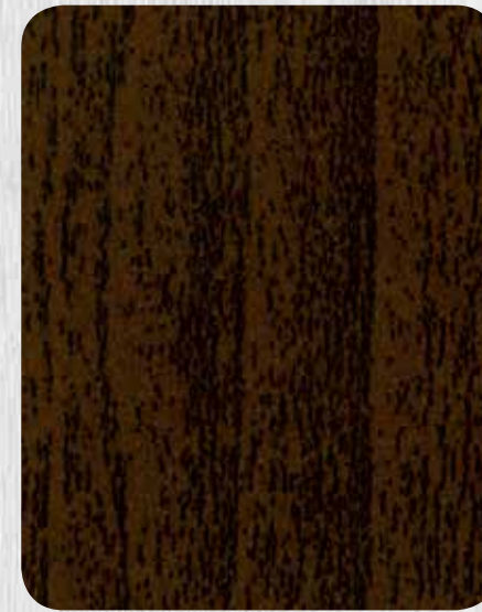
Dark Walnut - DS733S + 1802/02