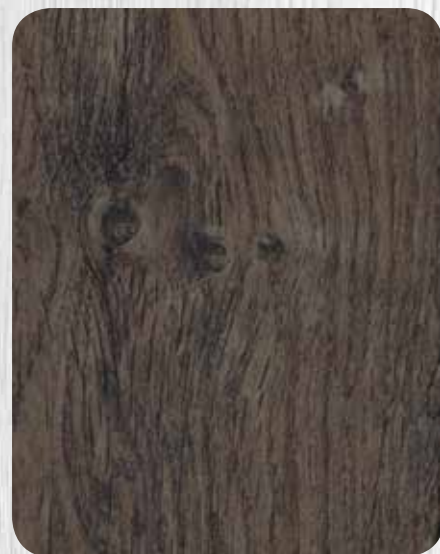
Aged Dark Oak - 86-039S + 2504/01