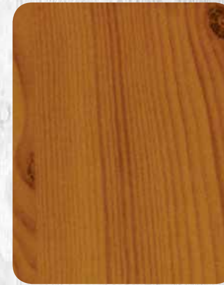
Knotty Pine - DS716S + 2103/01