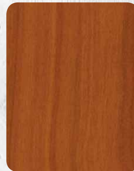
Table Cherry - DS716S + 1405/02