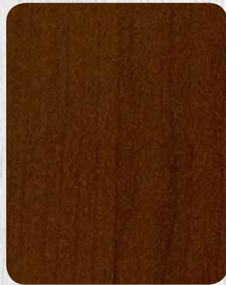
American Maple - DS733S + 1102/01