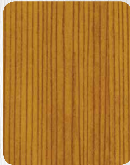
American Douglas - DS402S + 1501/02