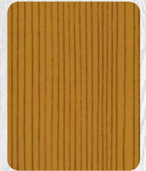
Oregon Douglas - DS716S + 1502/02