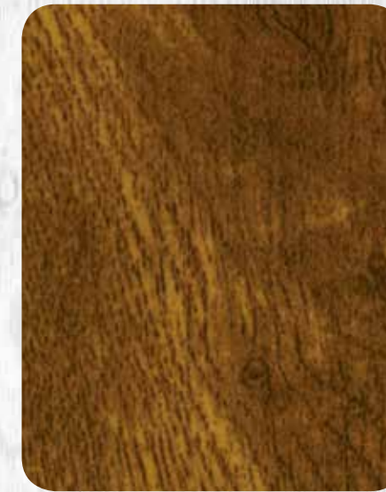
Oak - DS716S + 2301/02