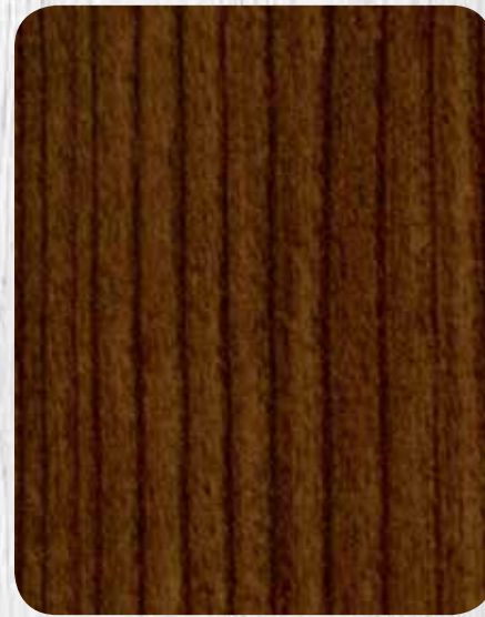
Cherry - DS733S + 1402/02