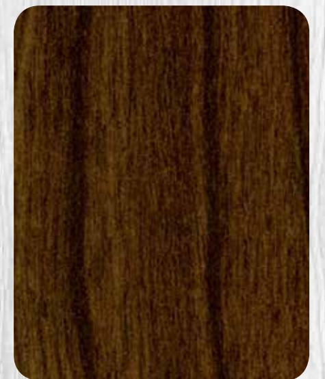
Teak - DS733S + 2601/01