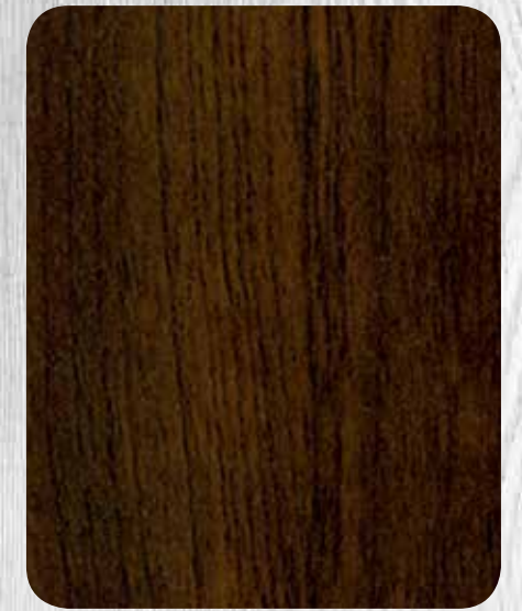
National Walnut - DS733S + 1806/02